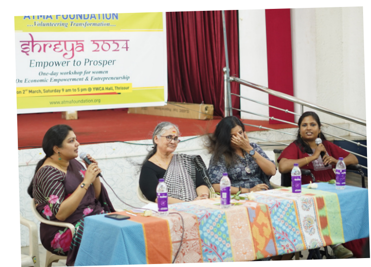
The Success Stories